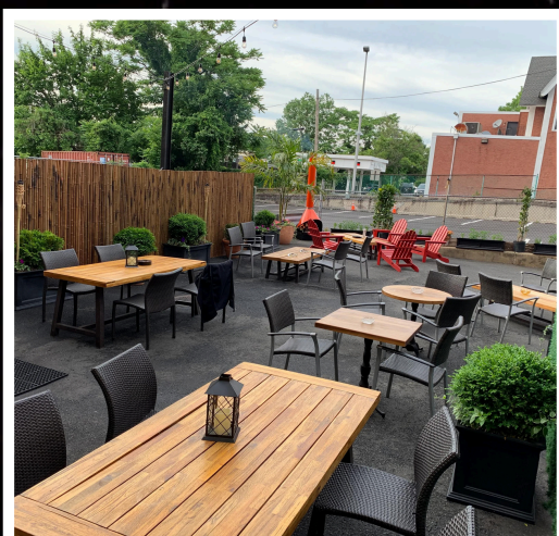
Table Tops for Restaurant

Make sure the room is clutter-free, and remove unnecessary furniture and accessories. Make sure they have plenty of room to visualize their furniture fitting.